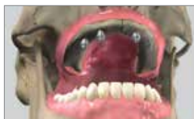
Implants in place and ready for provisional denture