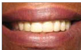
Patient on day of surgery