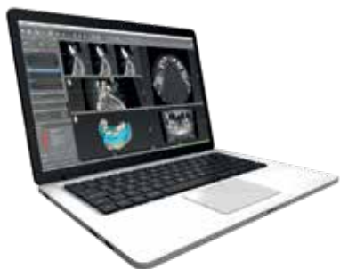
Digital treatment planning