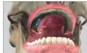
Delivery of implants