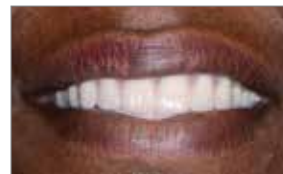
Final restoration in place