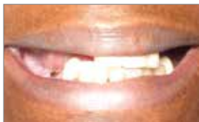
Teeth extracted prior to implant placement