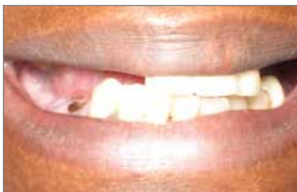
Current patient situation

Implant-supported dentures that include a screw-retained restoration are removable by your dentist only for maintenance.