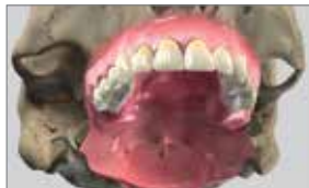
Provisional restoration in place