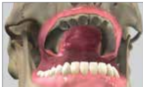
Teeth extracted prior to implant placement